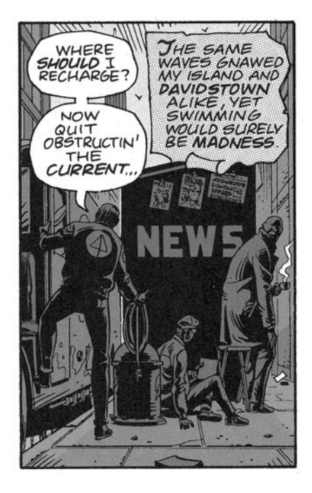
Figure 4: Alan Moore et al. Watchmen. 1987. New York: DC Comics, 2005. Chapter V, 8.

the words it asks us to imagine as spoken, but in figuring forth those words as contained within breath (if in a highly conventionalized form), the modern comic book foregrounds an oral/aural essence necessarily absent from its own visual medium.<sup>4</sup> In line with this displacement of writing as writing when speech is being pictured, the genre offers various visual markers for properly written language—letters, diary entries, newspaper articles are frequently represented, often in forms strikingly similar to early modern scrolls. In offering a special pictorial form for script or print, however, these modern images implicitly draw a sharp distinction between written and spoken words (Fig. 4). The presence of quasi-documentary objects in the panels of a graphic novel reaffirms that what is contained in the speech balloons only incidentally looks like writing, and ought to be read, so to speak, as voice.