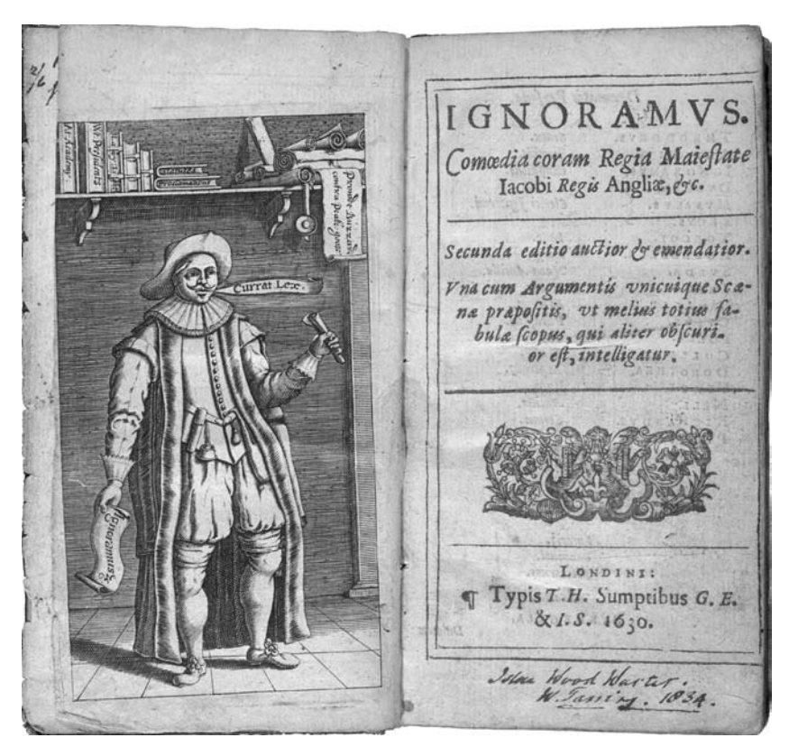
Figure 5: Frontispiece engraving from George Ruggle, Ignoramus. Comoedia coram Regia Maiestate Iacobi Regis Angliae. London: Thomas Purfoot for I. Spencer, 1630 (STC 21445).

their titles inscribed on the edge of the paper facing outward: "Proclamations", we read; "Presidents", "Statutes". A jumble of scrolls fills the right half of the shelf, one of which unfurls to display a reference to a suit featuring in the play, Buzzard vs. Goose; another unfolds from the lawyer's right hand, showing his name;<sup>5</sup> a third emanates from his mouth, proclaiming "Currat Lex": "let the law run its course".