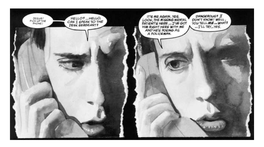
Figure 1: Grant Morrison and Jon J Muth, The Mystery Play, New York: Vertigo / DC Comics, 1994. Reprinted by permission.

breath. They gesture, if anywhere, away from the written characters inside them towards the mouths of the figures, and the living voices emanating, imaginatively, from them.