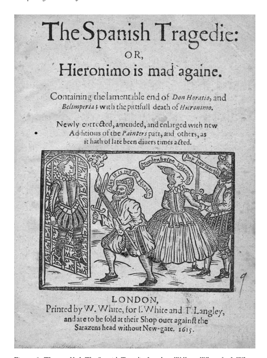
Figure 9: Thomas Kyd, The Spanish Tragedie, London: William White for I. White & T. Langley, 1615 (STC 15091a), titlepage.