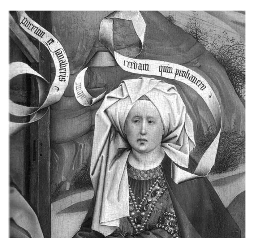
Figure 8: Detail from Robert Campin, The Nativity (1420-25), oil on wood (oak). Dijon, Musée des Beaux-Arts.

While the episode has various sources, among them the Legenda Aurea and the gospel of Pseudo-Matthew, it also was a staple of religious drama at least until the mid-fifteenth century, and art historians have frequently suggested that the painter drew his inspiration from contemporary mystery plays.<sup>37</sup> Although no direct source for the midwives' lines has been identified, their chirographic features encourage the viewer to interpret them as actual theatrical parts—the strips of paper or parchment actors were given to memorize their roles. From that perspective, Campin's Nativity might aptly be